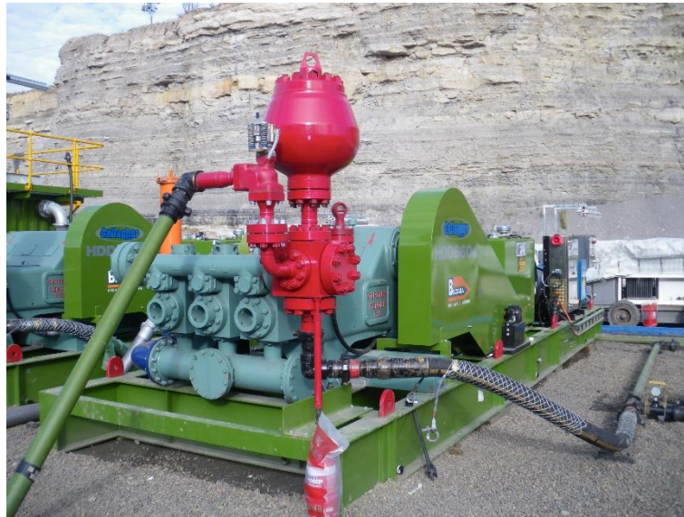
Gardner Denver PZ8 Pump

Maxibor has used its extensive knowledge and innovation to extend one of its Vermeer 100x120 drill rigs so that it can take up to 30 feet drill pipe thereby allowing the drill to ream out to a larger diameter especially in hard ground conditions. Vermeer 100x120s, or similar sized rigs, unless extended to take the long rods, are limited in the size they can expand bore holes to in hard ground conditions due to the greater wrap/flex of the conventional smaller rods.