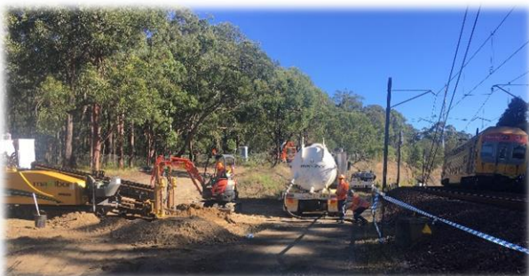
Sydney Trains electrical and communications upgrade

Our key senior and operational staff have all the required accreditations to work in the rail sector. Most of our operational staff already have RIW cards with others holding Safely Access the Rail Corridor and Rail Infrastructure (trackwork) tickets.