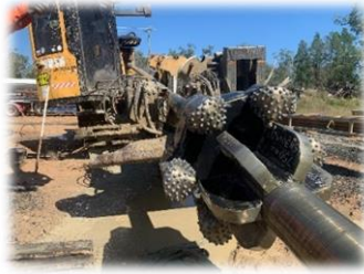
Vermeer 100x120 with rock cutter

Maxibor has 7,000 metres of 7,000 metres of 5" drill pipe and 4,500 metres 6 5/8" drill pipe along with a range of cutters and reamers for any sized bore.