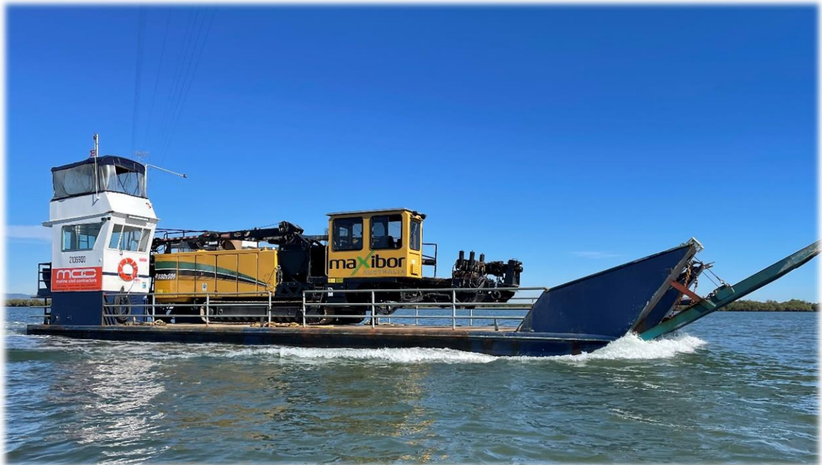
Maxibor's Vermeer 300x500 on way to Lamb Island

Maxibor's cooperative and collaborative approach was much appreciated on the design and install of a new 400 metre section of DN400 PN20 pipeline between Lamb and Macleay Islands in Queensland. With the existing pipeline slowly leaking, Maxibor was engaged by Christopher Contracting to help Seqwater ensure continued service to the Lamb Island community. Our approach enabled the various stakeholders to be brought together to quickly provide a design which solved the problem and minimised costs. Maxibor completed the works well ahead of schedule, much to satisfaction of contractor and asset owner and to the relief of the Lamb Island community.