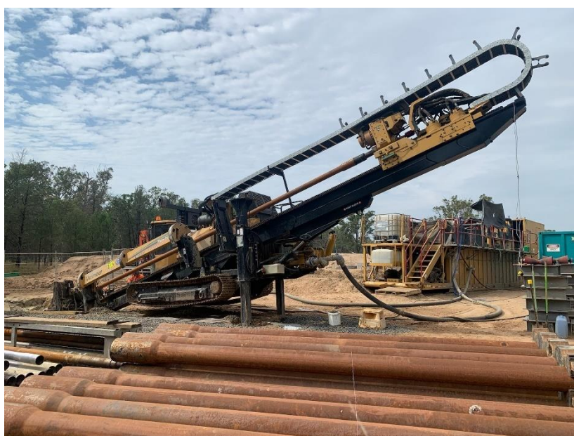
Extended Vermeer 100x120

The extended Vermeer 100x120 now effectively has the same capacity of a maxi-rig with a smaller site footprint and lower operational cost.