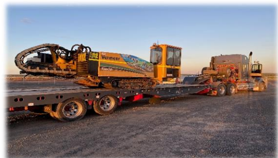
Goonyella Riverside technology enabling project