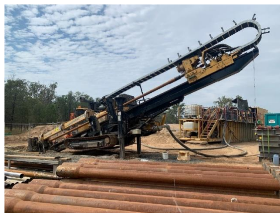
Extended Vermeer 100x120

The extended Vermeer 100x120 now effectively has the same capacity of a maxi-rig with a smaller site footprint and lower operational cost.