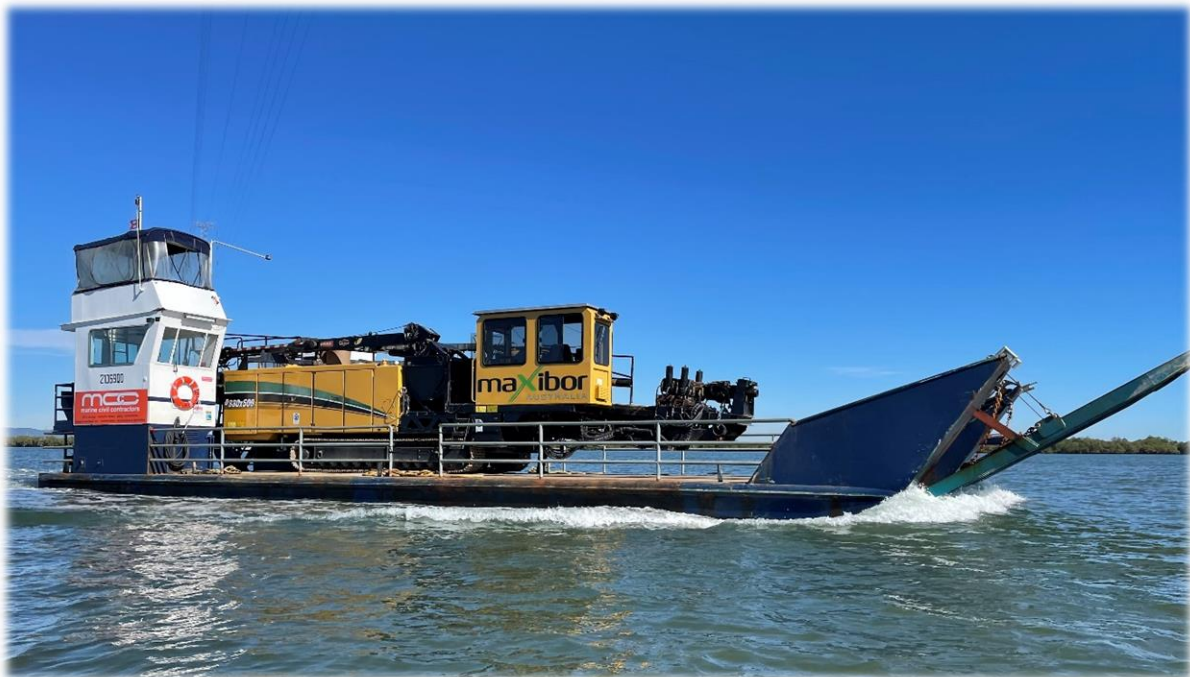
Maxibor's Vermeer 300x500 on way to Lamb Island

Maxibor's cooperative and collaborative approach was much appreciated on the design and install of a new 400 metre section of DN400 PN20 pipeline between Lamb and Macleay Islands in Queensland. With the existing pipeline slowly leaking, Maxibor was engaged by Christopher Contracting to help Seqwater ensure continued service to the Lamb Island community. Our approach enabled the various stakeholders to be brought together to quickly provide a design which solved the problem and minimised costs. Maxibor completed the works well ahead of schedule, much to satisfaction of contractor and asset owner and to the relief of the Lamb Island community.