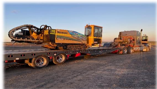
Goonyella Riverside technology enabling project