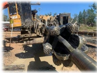
Vermeer 100x120 with rock cutter

Maxibor has 7,000 metres of 5" drill pipe and 4,500 metres 6 5/8" drill pipe along with a range of cutters and reamers for any sized bore.